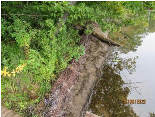
Photos – Above : Coir logs protect the shoreline. Left : Willow wattles placed at the raw bank

A wide variety of projects are eligible for financial and technical assistance including stabilization with willow wattles (fascines), coir logs, and native vegetation as well as rain gardens to capture runoff. These practices will protect the water quality of the lake, which preserves the cool, well-oxygenated water needed to sustain the cisco fishery.